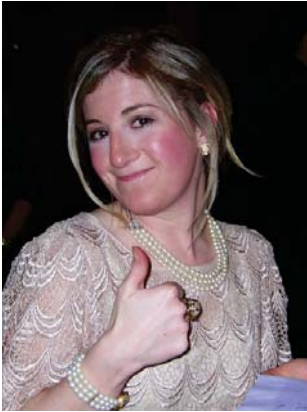
THUMBS UP TO THE ALL WOMEN'S BALL!

On Saturday, February 1st, from 8:00-11:00pm, Community Human Services will host the 8th Annual All Women's Ball at All Saints Church located on the corner of Dolores and 9th in downtown Carmel. All proceeds will benefit Community Human Services' Elm House and Safe Place programs. The event has a suggested donation of $20 and all WOMEN are welcome. (All MEN are welcome to volunteer!)